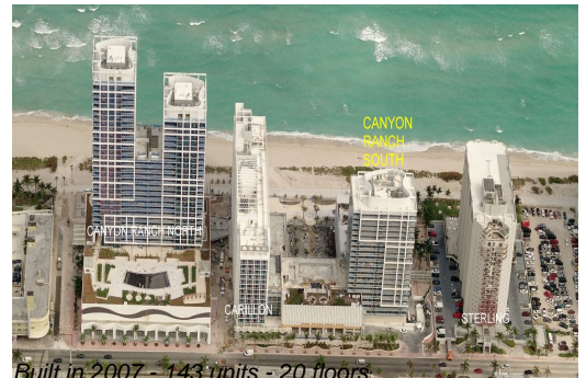
Built in 2007 - 143 units - 20 floors