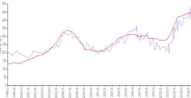
2000 Williams Island vs Aventura