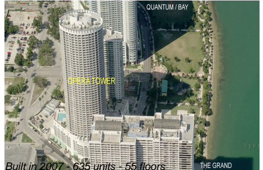
Built in 2007 - 635 units - 55 floors