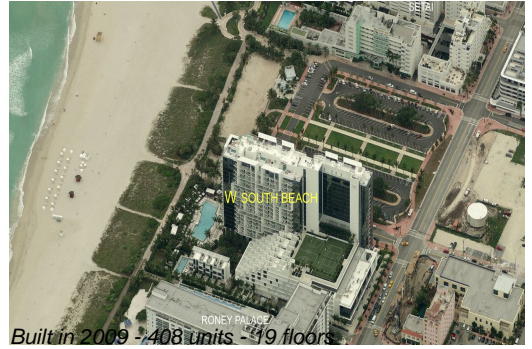
Built in 2009 - 408 units - 19 floors

MLS Number: A11563717 Status: Active Size: 933 Sq ft. Bedrooms: 1 Full Bathrooms: 1 Half Bathrooms: 1 Parking Spaces: Additional Spaces Available,Covered Parking,Parking-Under Building View: List Price: $2,100,000 List PPSF: $2,251 Valuated Price: $1,923,000 Valuated PPSF: $2,061