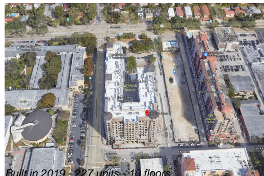
Built in 2019 - 227 units - 10 floors