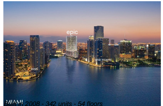
MIAMI: 2008 - 342 units - 54 floors