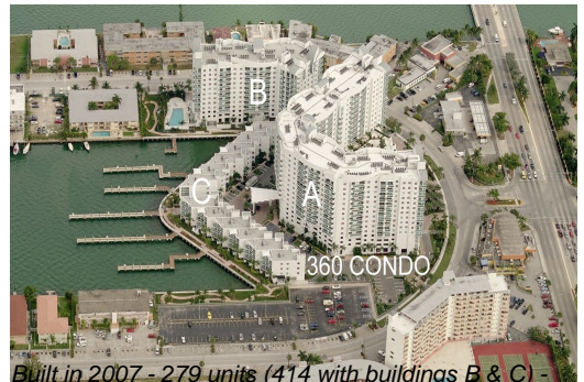
Built in 2007 - 279 units (414 with buildings B & C) - 15 floors