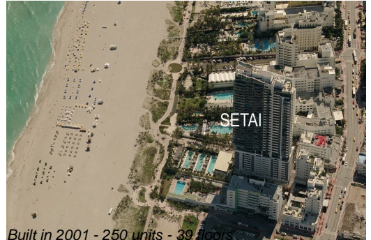
Built in 2001 - 250 units - 39 units for sale