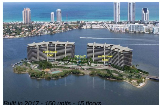
Built in 2017 - 160 units - 15 floors