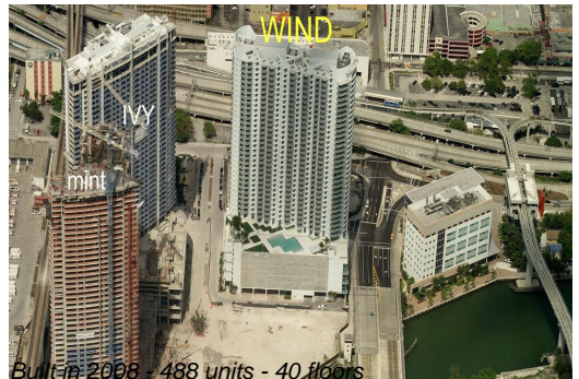
Build in 2008 - 488 units - 40 floors