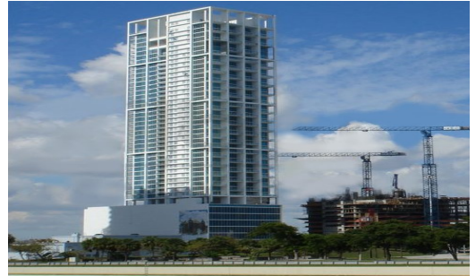
Built in 2007 - 200 units - 48 floors