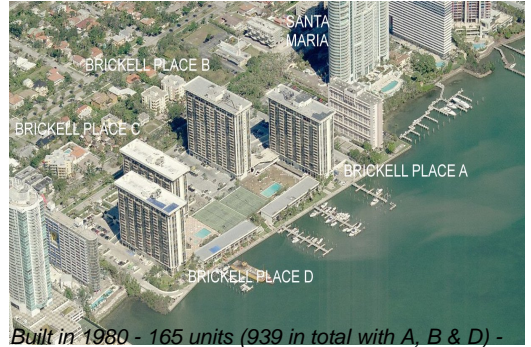
Built in 1980 - 165 units (939 in total with A, B & D) - 18 floors