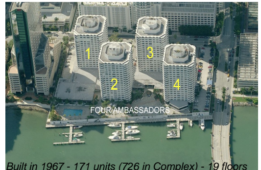
Built in 1967 - 171 units (726 in Complex) - 19 floors