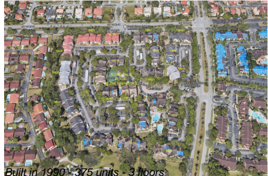
Built in 1990 - 375 units - 3 floors