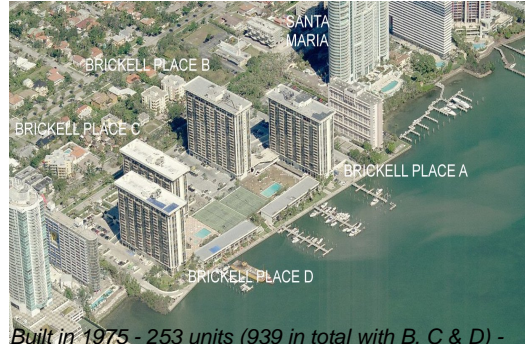
Built in 1975 - 253 units (939 in total with B, C & D) - 23 floors