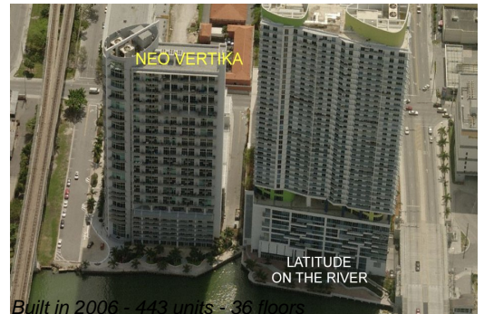
Built in 2006 - 443 units - 36 floors