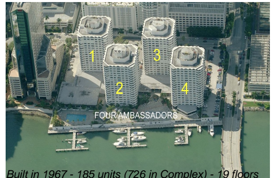
Built in 1967 - 185 units (726 in Complex) - 19 floors