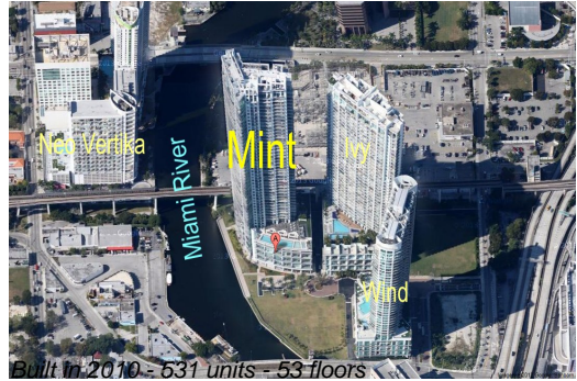
Built in 2010 - 531 units - 53 floors