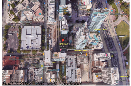
Built in 2022 - 231 units - 30 floors