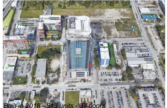
Built in 2018 - 513 units - 37 floors