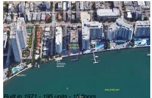
Built in 1971 - 195 units - 15 floors