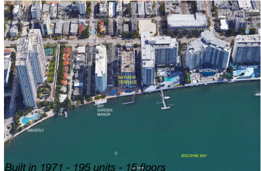
Built in 1971 - 195 units - 15 floors