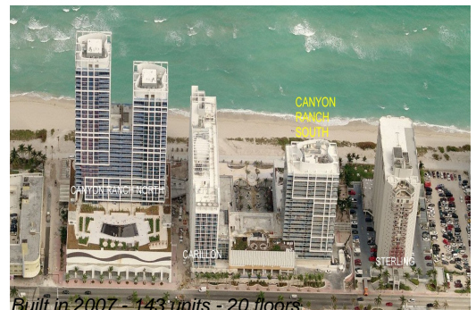
Built in 2007 - 143 units - 20 floors