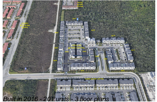
Built in 2016 - 201 units - 3 floor plans