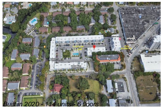
Built in 2020 - 114 units - 6 floors