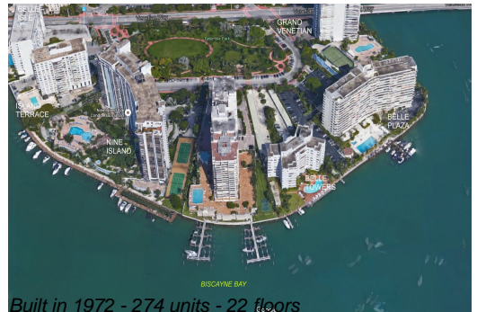
Built in 1972 - 274 units - 22 floors