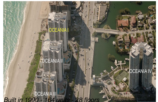
Built in 1990 - 164 units - 28 floors