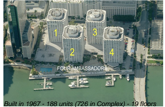
Built in 1967 - 188 units (726 in Complex) - 19 floors