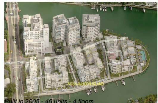
Built in 2005 - 46 units - 4 floors