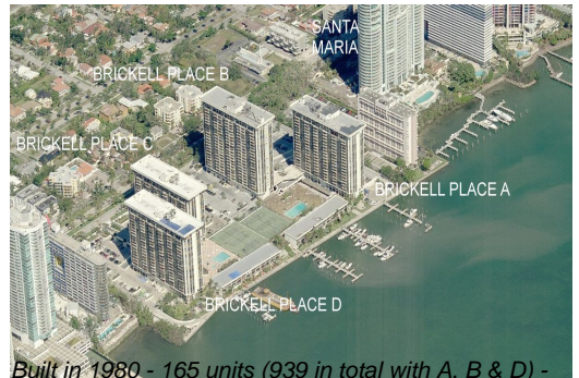
Built in 1980 - 165 units (939 in total with A, B & D) - 18 floors