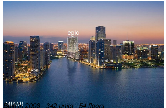
MIAMI 2008 - 342 units - 54 floors