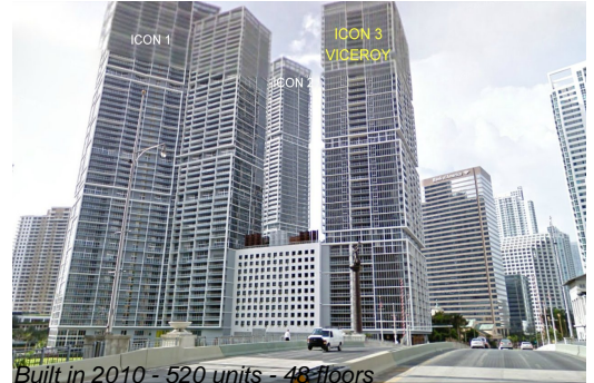
Built in 2010 - 520 units - 48 floors