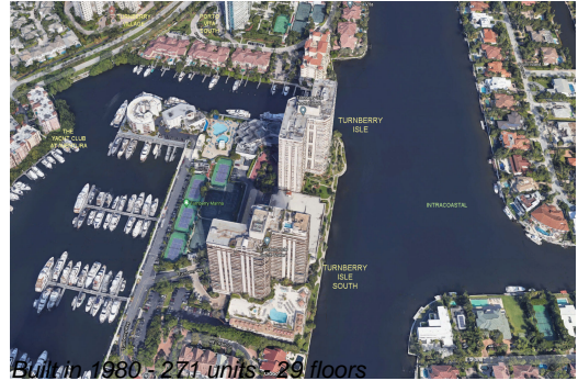
Building 1980 - 271 units - 29 floors