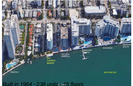
Built in 1964 - 238 units - 15 floors