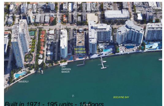
Built in 1971 - 195 units - 15 floors