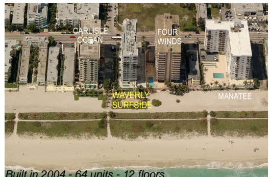
Built in 2004 - 64 units - 12 floors