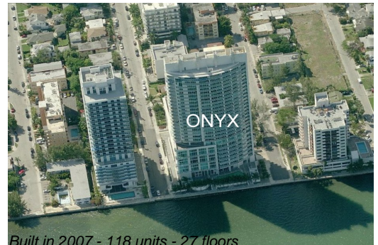
Built in 2007 - 118 units - 27 floors