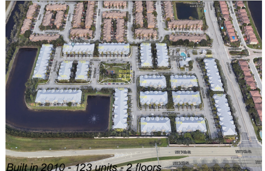
Built in 2010 - 123 units - 2 floors