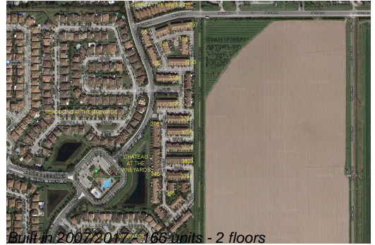
Built in 2007/2017, 166 units - 2 floors