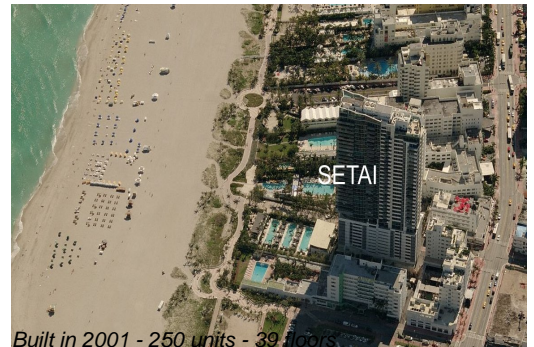
Built in 2001 - 250 units - 39 floors