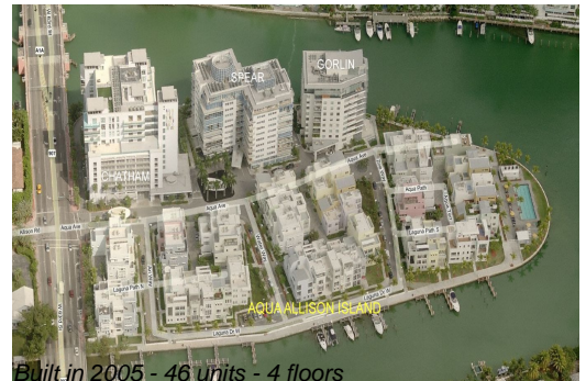
Built in 2005 - 46 units - 4 floors