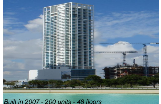
Built in 2007 - 200 units - 48 floors