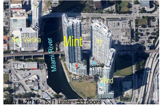
Built in 2010 - 531 units - 53 floors