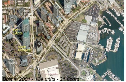
Built in 2001 - 124 units - 21 floors

MLS Number: A11573607 Status: Active Size: 1,530 Sq ft. Bedrooms: 2 Full Bathrooms: 2 Half Bathrooms: 1 Parking Spaces: Assigned Parking, Guest Parking, Valet Parking View: Bay, Other View Rental Price: $12,000 List PPSF: $8 Valuated Price: $1,199,000 Valuated PPSF: $1,033