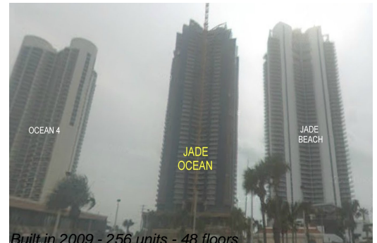
Built in 2009 - 256 units - 48 floors