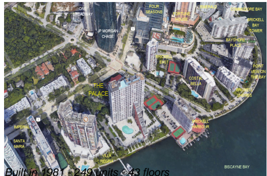
Built in 1981 - 249 units, 44 floors