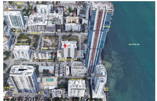
Built in 2012 - 96 units - 18 floors