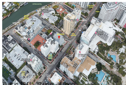
Built in 1941 - 32 units - 4 floors