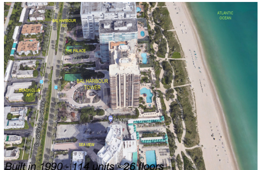
Built in 1990 - 114 units - 26 floors