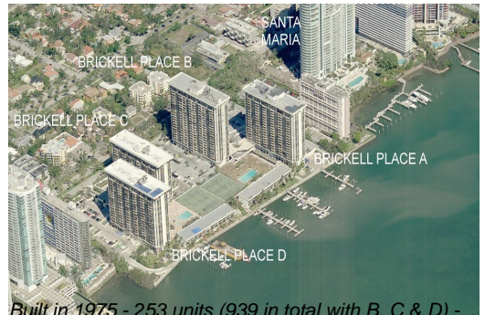
Built in 1975 - 253 units (939 in total with B, C & D) - 23 floors