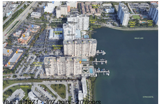
Built in 1971 - 307 units - 20 floors